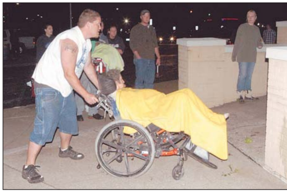
A volunteer rolls one of the injured into the shelter Sunday night at Memorial Hall. GLOBE | VINCE ROSATI