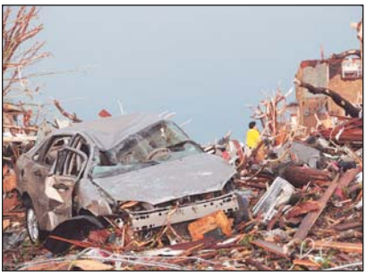
A mangled vehicle sits atop a pile of rubble at 24th and Main streets in the wake of the tornado that slammed Sunday through the middle of Joplin.