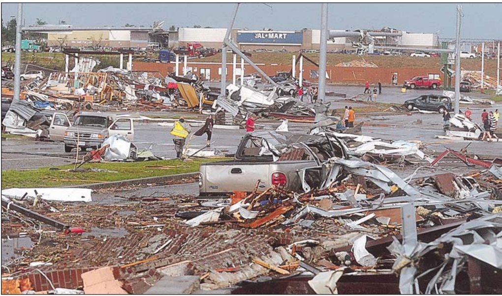
A view from 17th Street and Range Line Road shows the path of the devastating tornado that hit Joplin on Sunday afternoon.