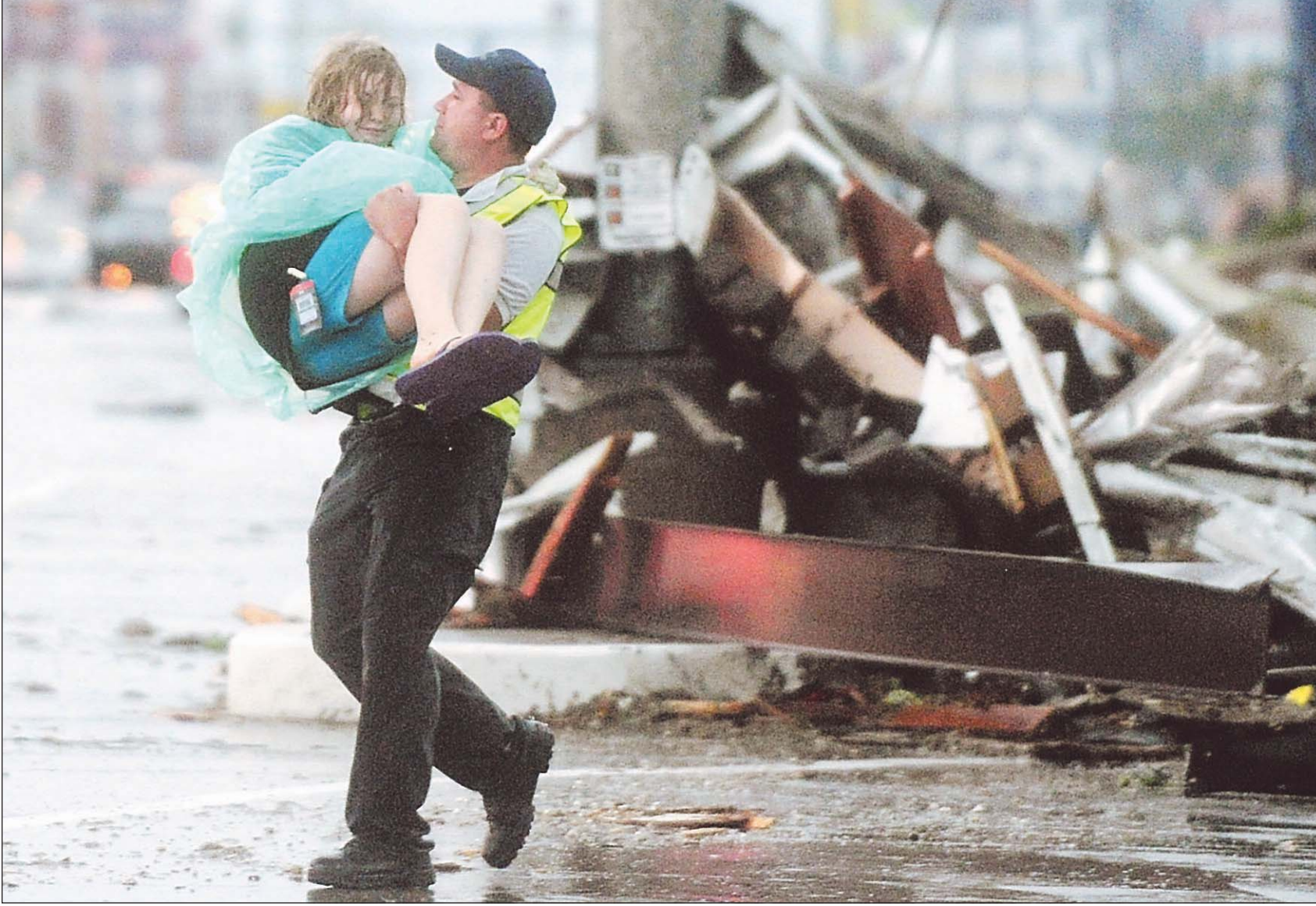
An emergency worker carries a girl to safety Sunday after a tornado struck Academy Sports & Outdoors on Range Line in Joplin.